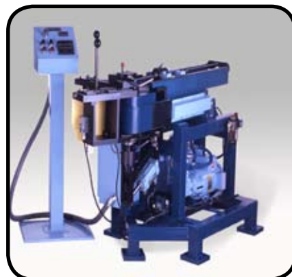
S1060 Rotary Draw Bender