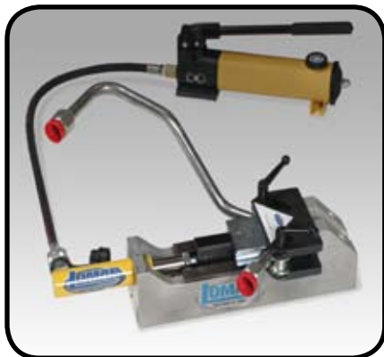
S1140 Portable Tube Bender & Flaring Tool

Let Lomar's development team assist with the design and development of tooling for all of your bending requirements.