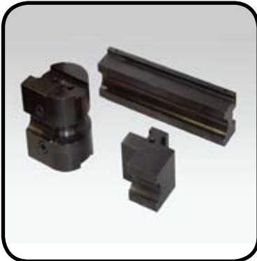
Bend Tooling designed and built for Lomar Benders and competitors.