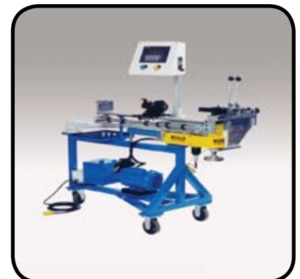
S1099C Rotary Draw Bender