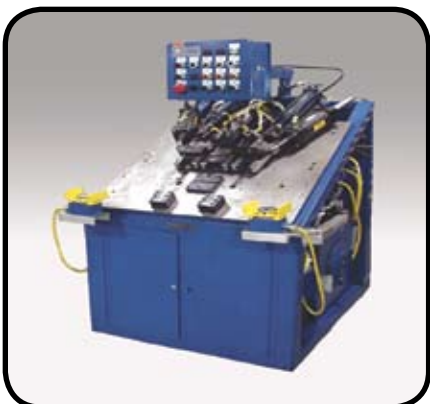
S1110 Universal Bender